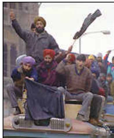
Sikhs have not been targeted before in Kashmir

A spokesman for a militant group, Lashkar-e Toiba, said the