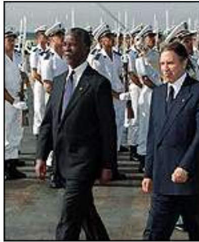
Mbeki visit hopes to improve economic conditions

More than 100,000 people, mostly civilians, have died in the civil strife which broke out in 1992 after elections which Islamists were poised to win were suspended.