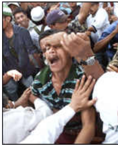
The ethnic violence has stirred deep passions