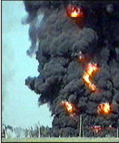
Heavy smoke billows over a Grozny oil plant

Ingushetia said 25,000 people were waiting in a traffic queue several kilometres long in the border area.