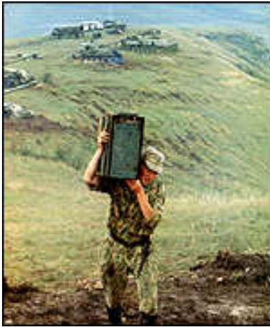
A Russian soldier ferries ammunition on the Dagestan-Chechen border

On the fifth day of air strikes, Russian bombers attacked oil refineries and factories south of Grozny.