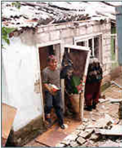
Grozny residents salvage belongings from their homes following the bombing