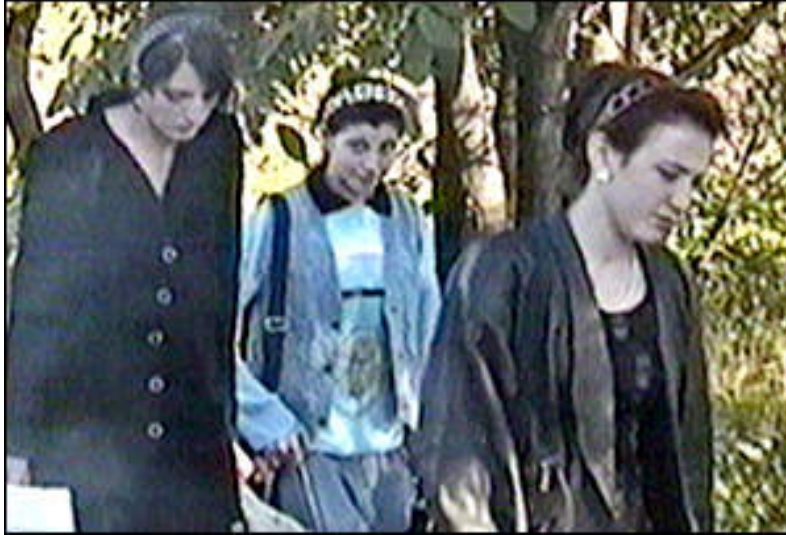
Chechen women cross into Ingushetia carrying their belongings

The southern Russian republic of Ingushetia has appealed for help in dealing with thousands of refugees fleeing Russian air strikes in neighbouring Chechnya.