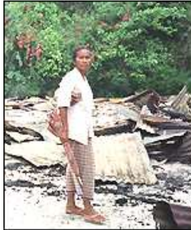
Violence in the Moluccas has left widespread devastation

The conflict intensified earlier this year with the arrival of volunteers from the Muslim paramilitary Laskar Jihad group, which is based in Java.