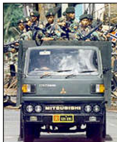
Indonesia has declared a civil emergency