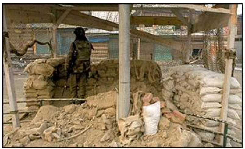
From Our Own The blast caused serious damage to the army barracks

A British Muslim has been named by an Islamic militant group in Indian-administered Kashmir as the suicide bomber who carried out a car bomb attack on Christmas Day which killed 10 people.