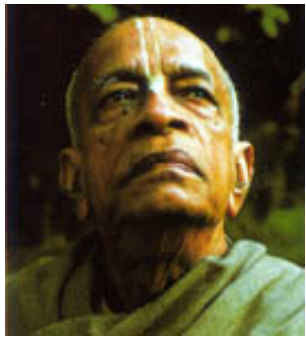
Prabhupada Founder-Acarya Hare Krishna Movement