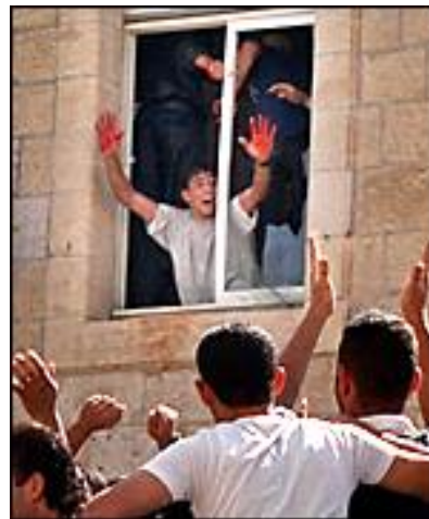
Blood on their hands: One of the killers gestures to the crowd

Their deaths were captured on film with the same power as the last moments of the short life of Muhammad al-Durrah, shot by Israeli troops 12 days ago as his father vainly tried to shield him with his own body.