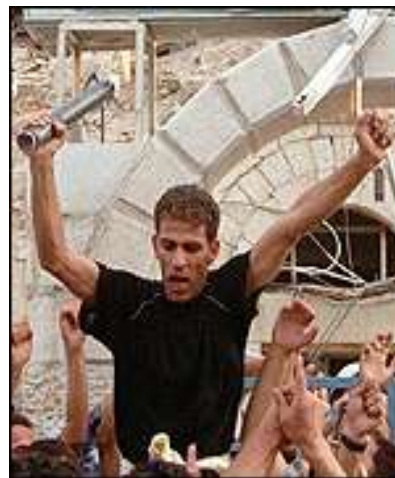
The bombed police station is backdrop for further demonstrations

The inevitable wrath of Israel came just as noon prayers were being called.