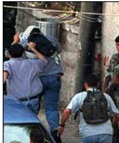
A Palestinian grabs one of the Israelis (who was in plain clothes)

Four men had been travelling in an unmarked car that was somehow apprehended on a street in Ramallah. At least two were killed a couple of hours later.